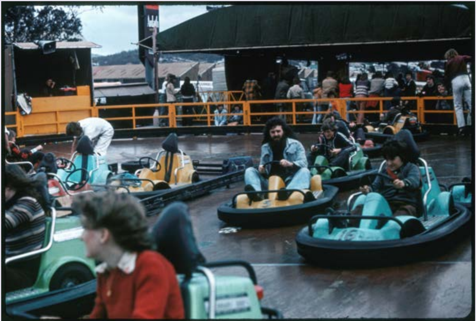
Royal Hobart Show. Dodgem cars, 1976 TA, NS3373/1/100