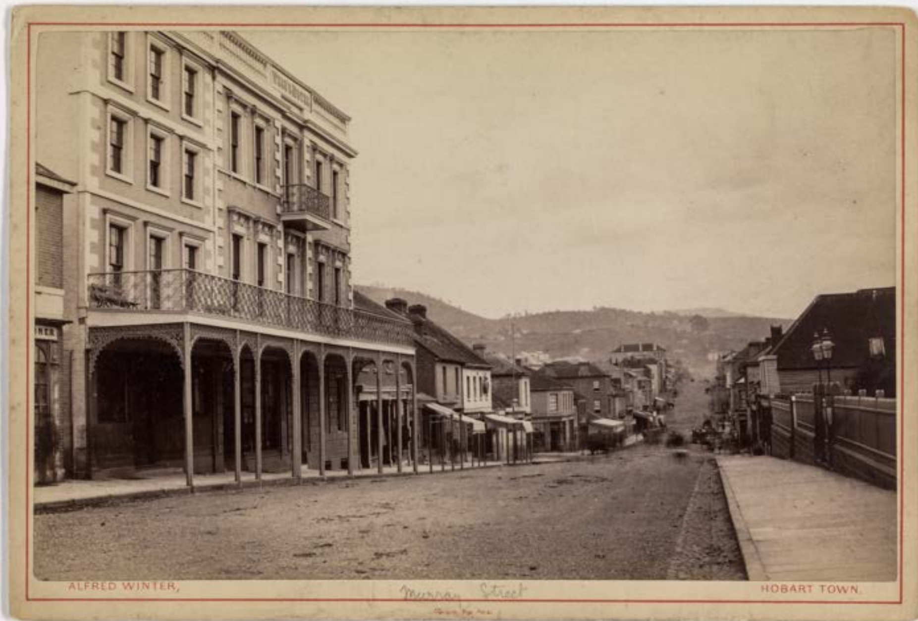
Webb's Hotel c1890