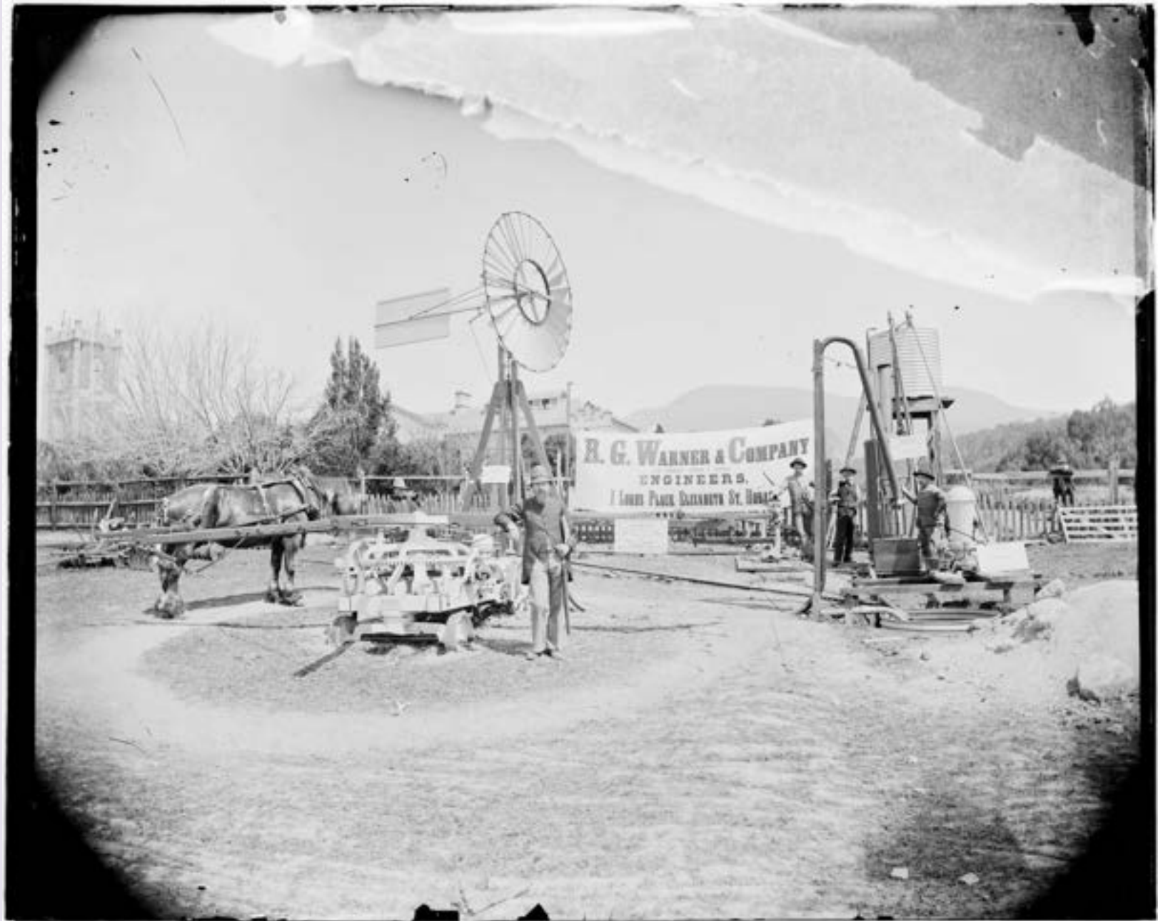
Warner & Co. Engineers Display, New Town Showground TA, NS1013/1/1916