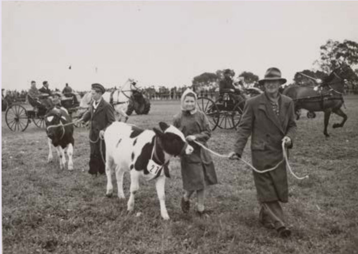
Grand Parade 1930s