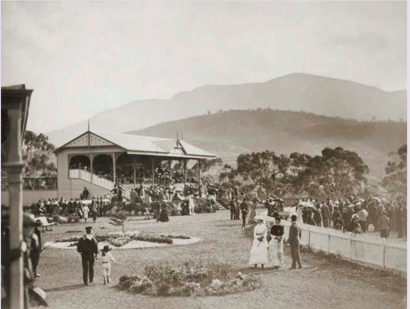
New Town Showground