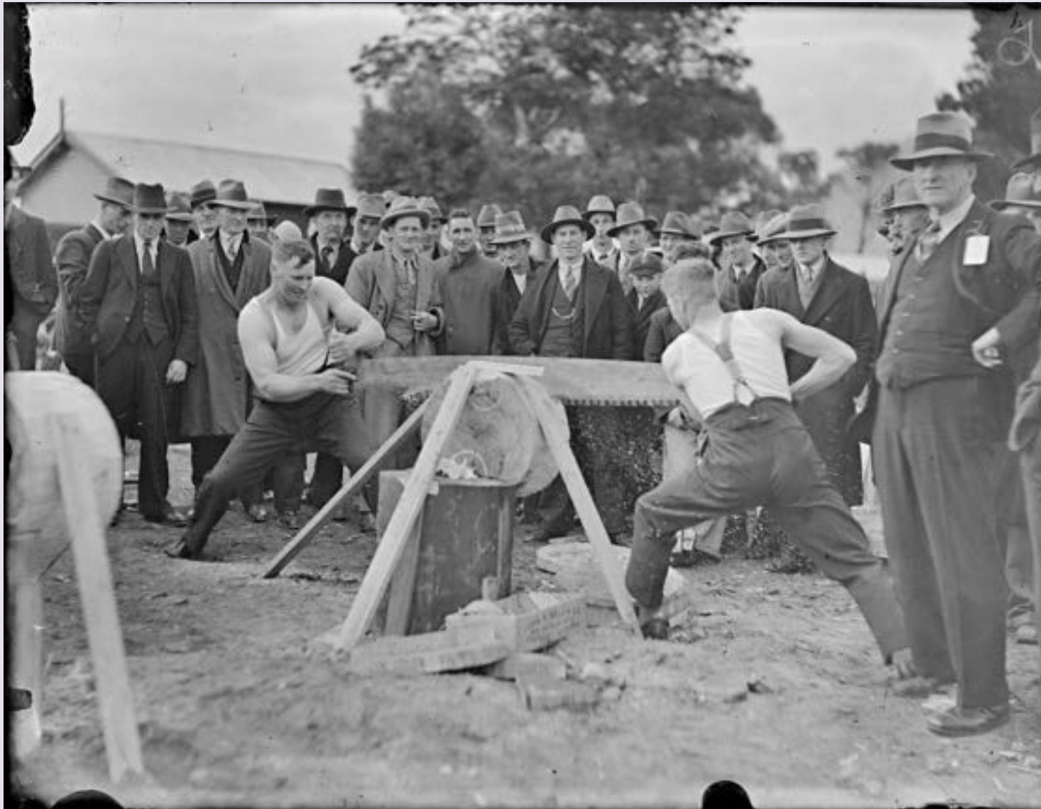
Cross-cut sawing contest 1935