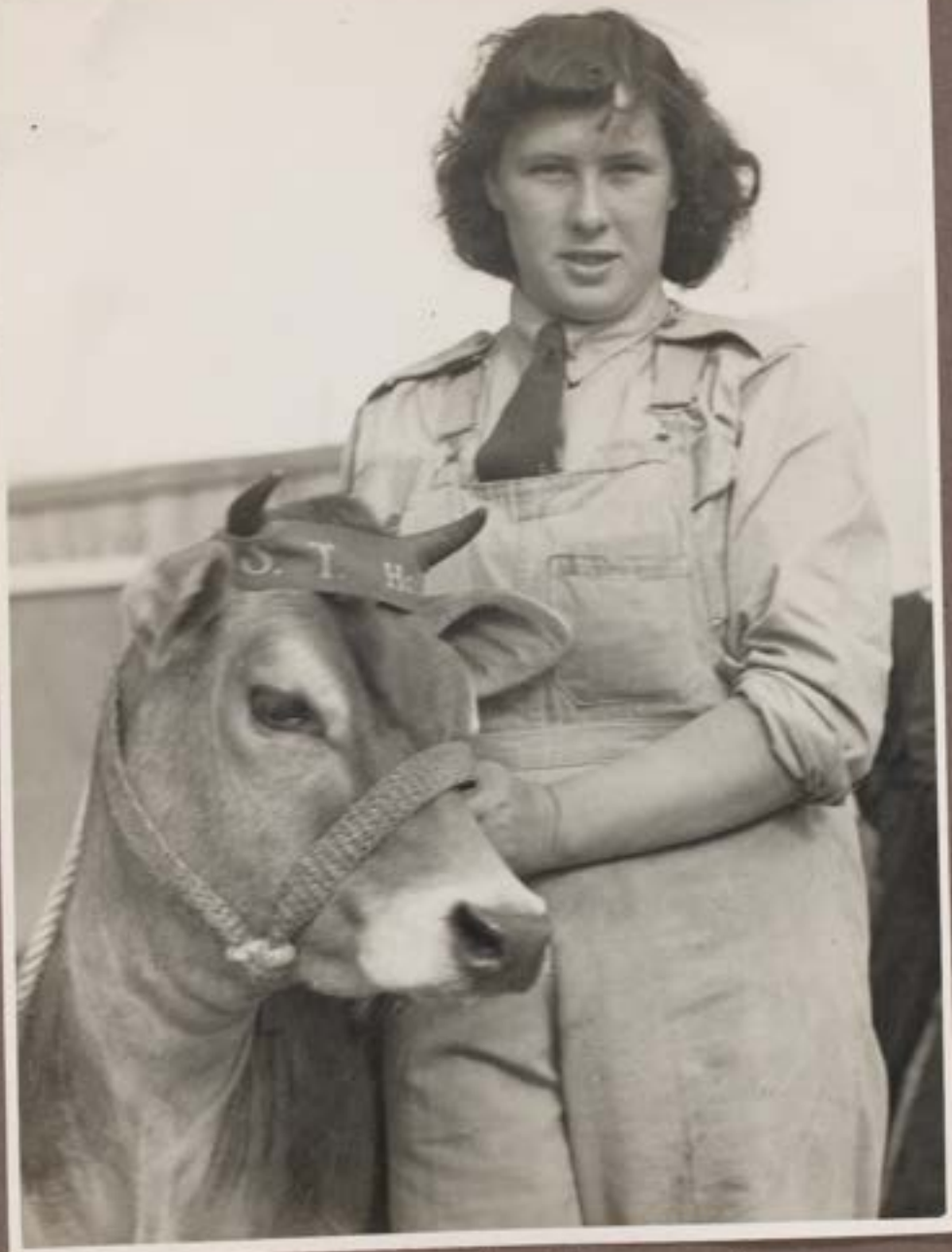
Australian Women's Land Army 1940s RAST Collection

An attractive study of a member of the A.W.L.A.