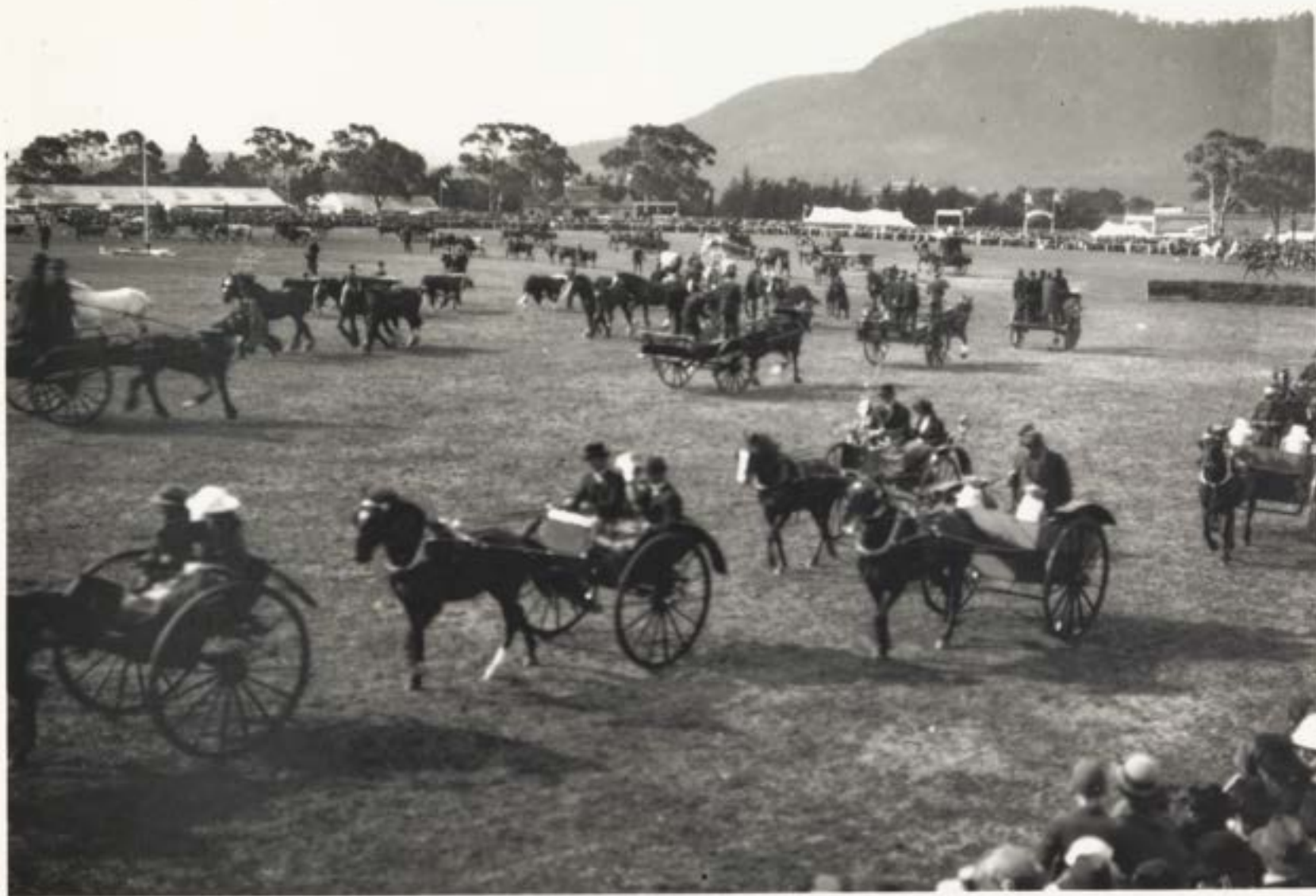
Grand Parade, early 1900s

TA, PH40/1/29