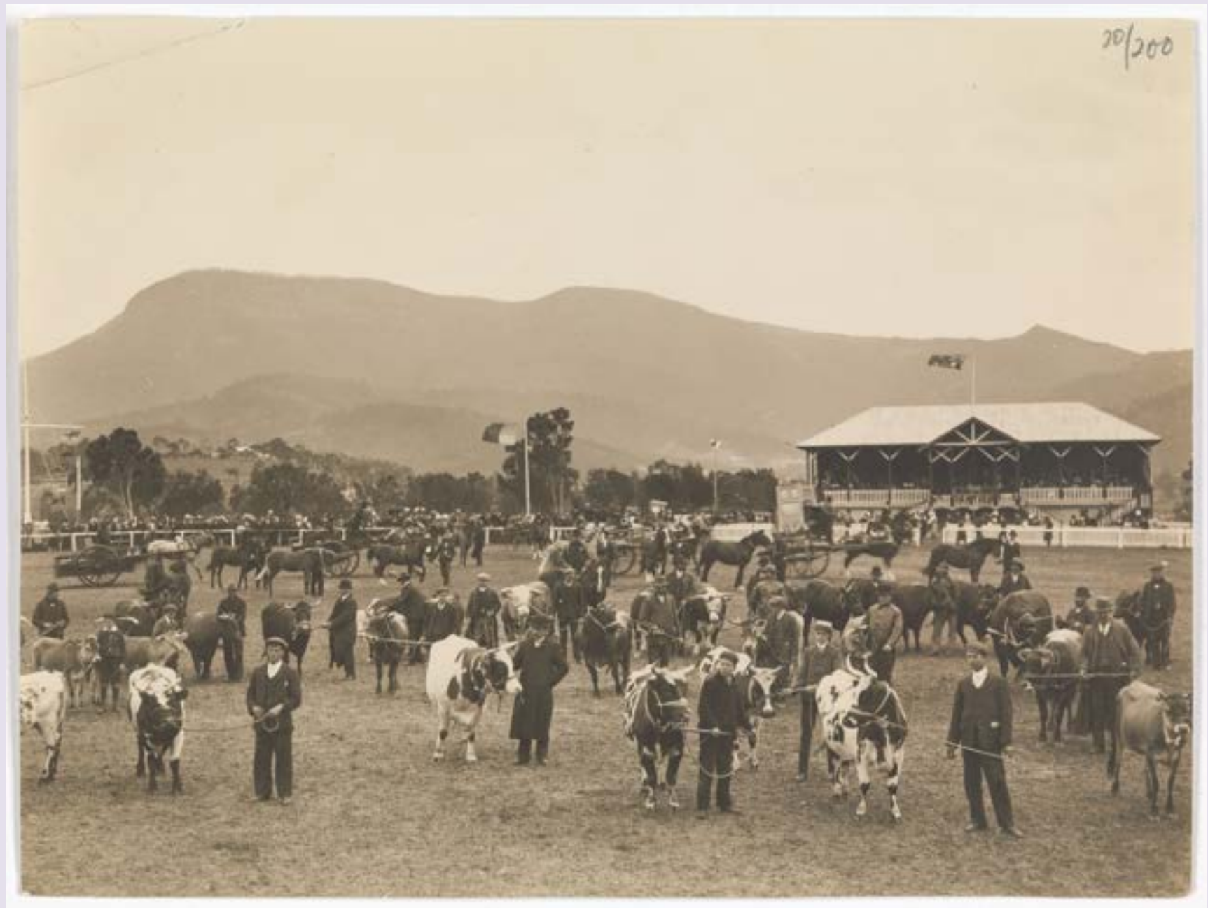
Grand parade 1920

TA, PH30/1/200