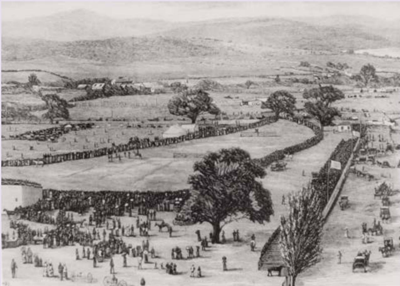
New Town Showground 1884