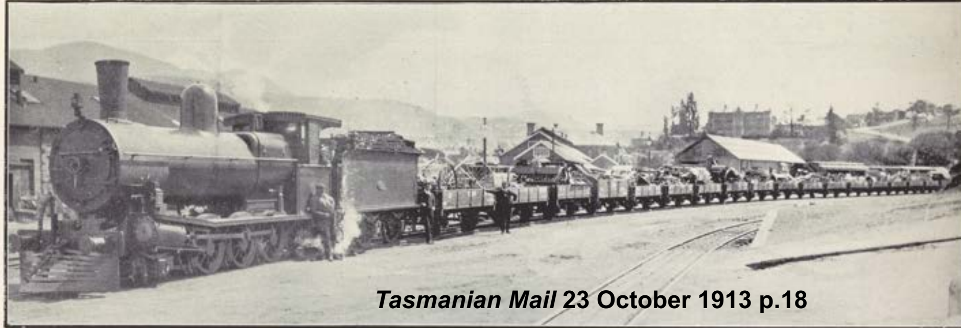
Tasmanian Mail 23 October 1913 p.18