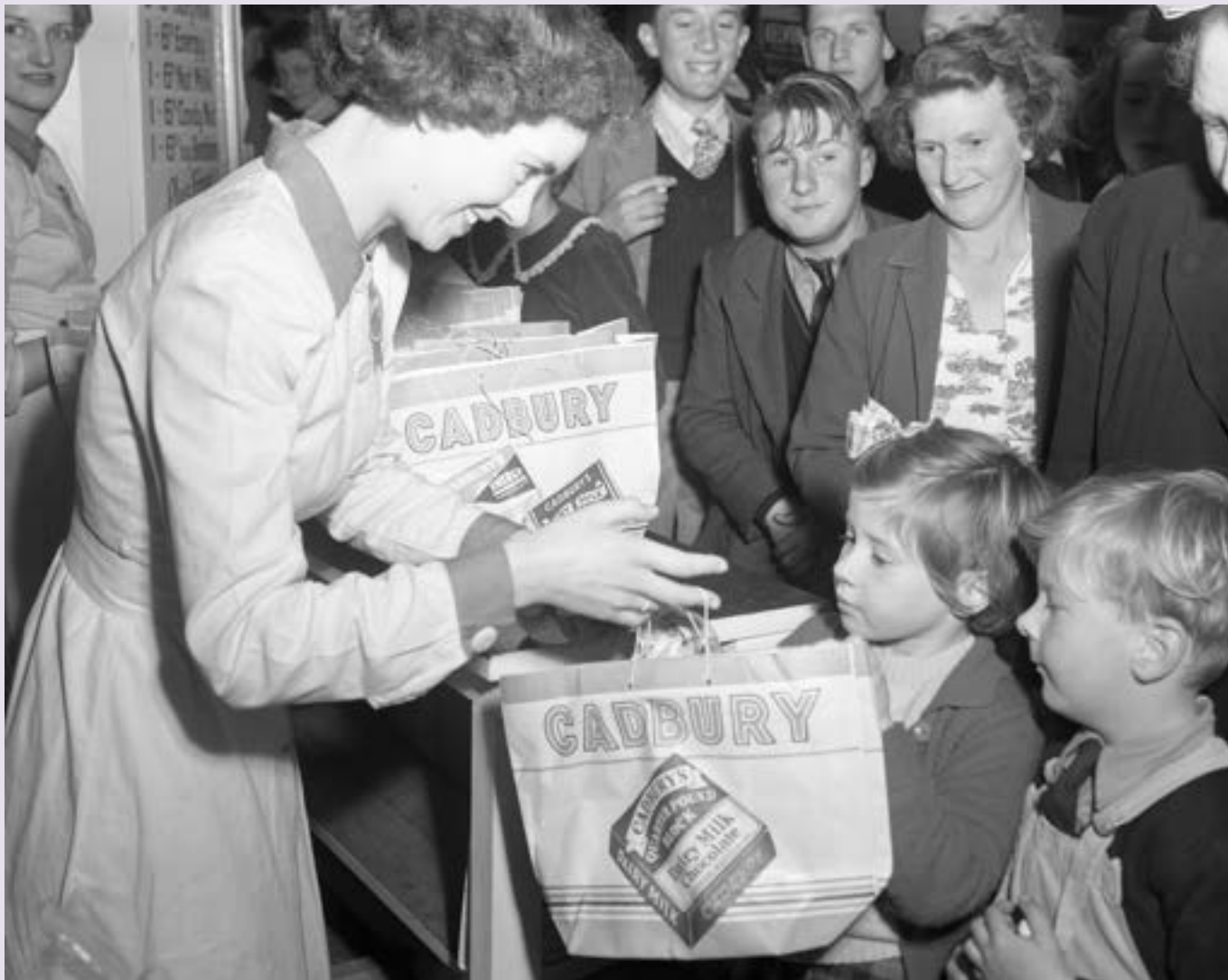
Children buying Cadbury sample bags