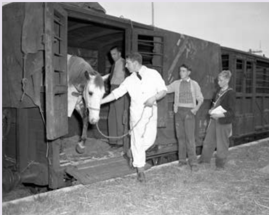
TA, AB713/1/1543