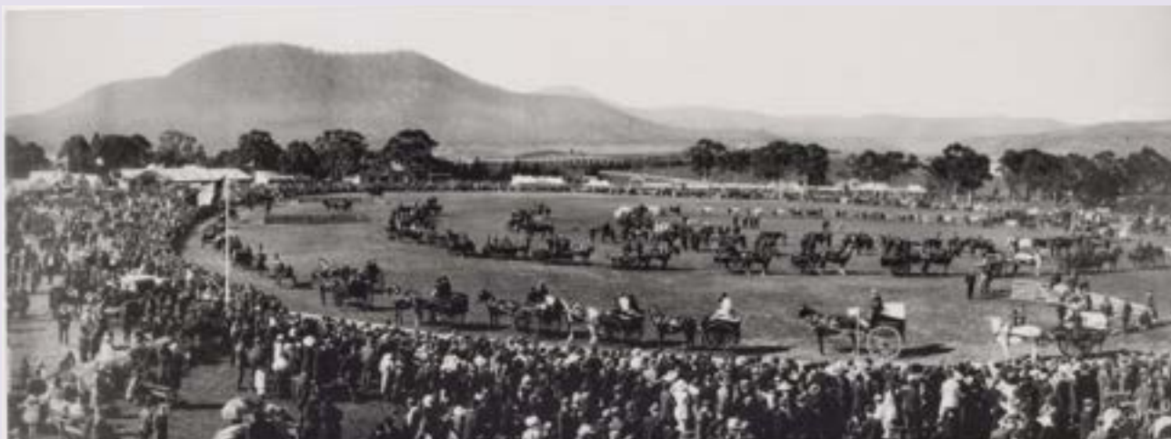
Grand Parade, no date